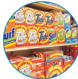
Use Less Soaps and Detergents