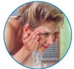
Skin stays naturally smooth; hair silky clean