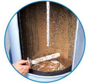
Save on Plumbing Fixtures & Repairs