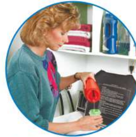
Softer, Fluffier Clothes